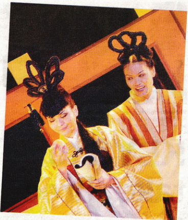
Contemporary: All the costumes, as well as the make-up, are very contemporary with Oriental influences.