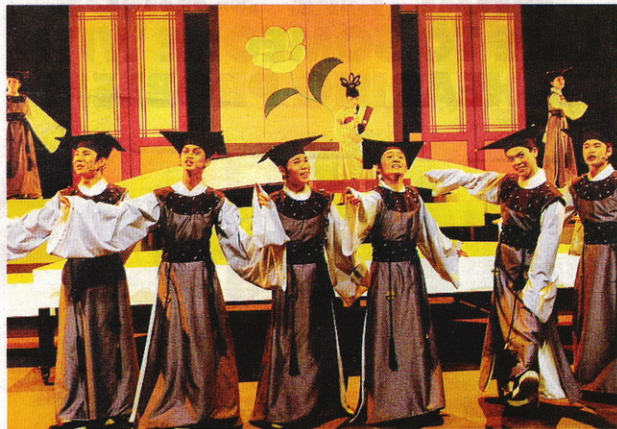
Ensemble: One of the ensemble pieces in a scene from 'Butterfly Lovers'.