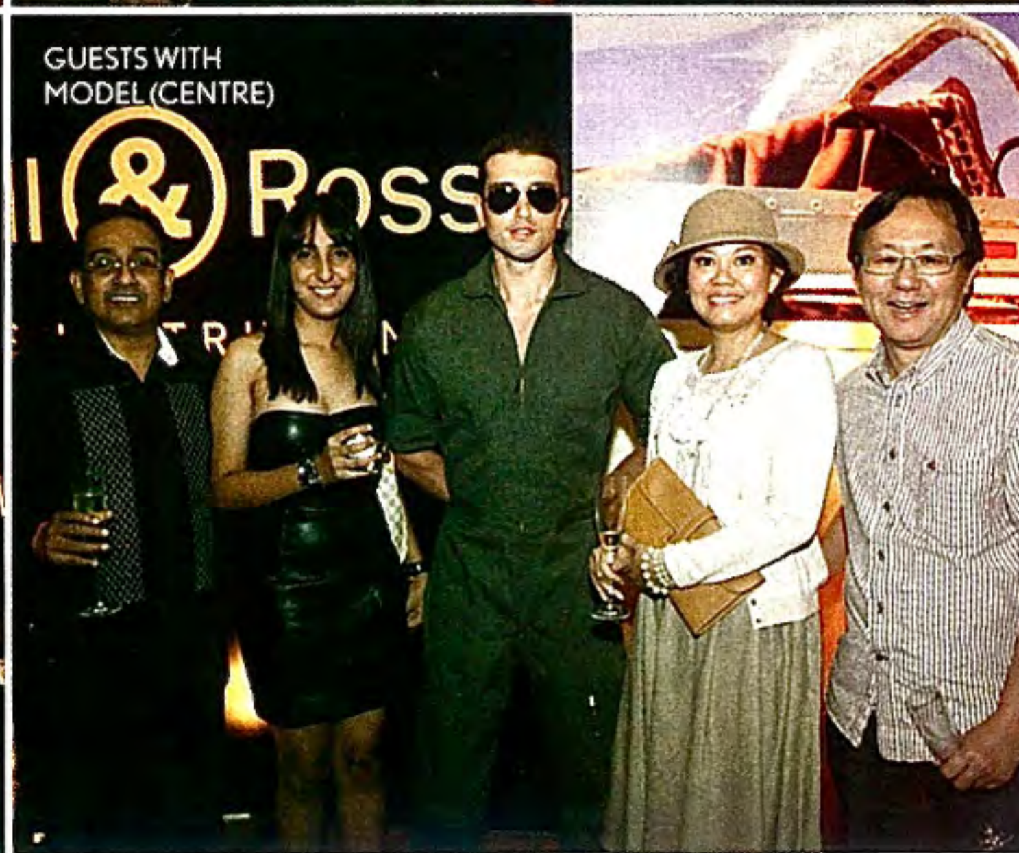
GUESTS WITH MODEL (CENTRE)