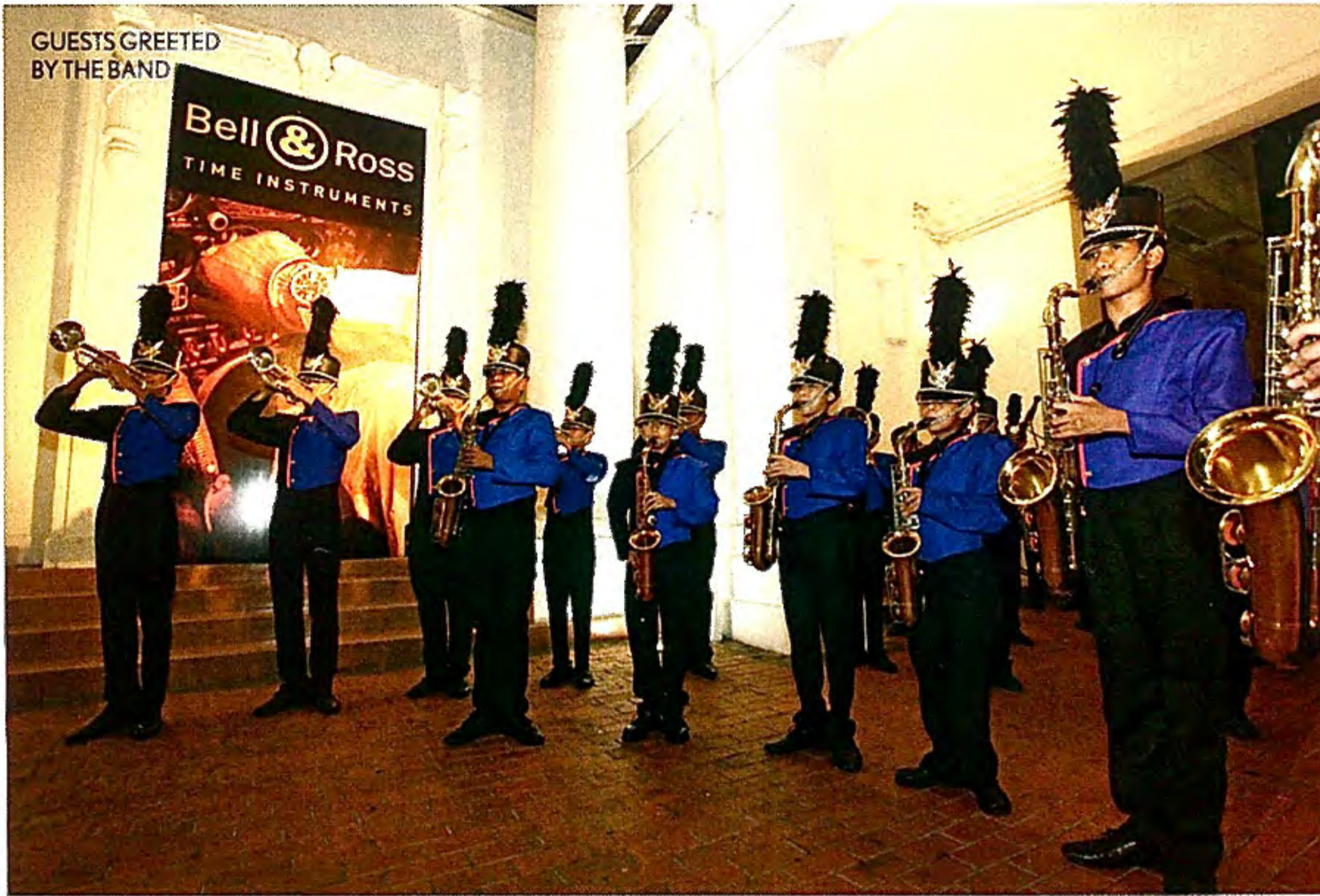
GUESTS GREETED BY THE BAND