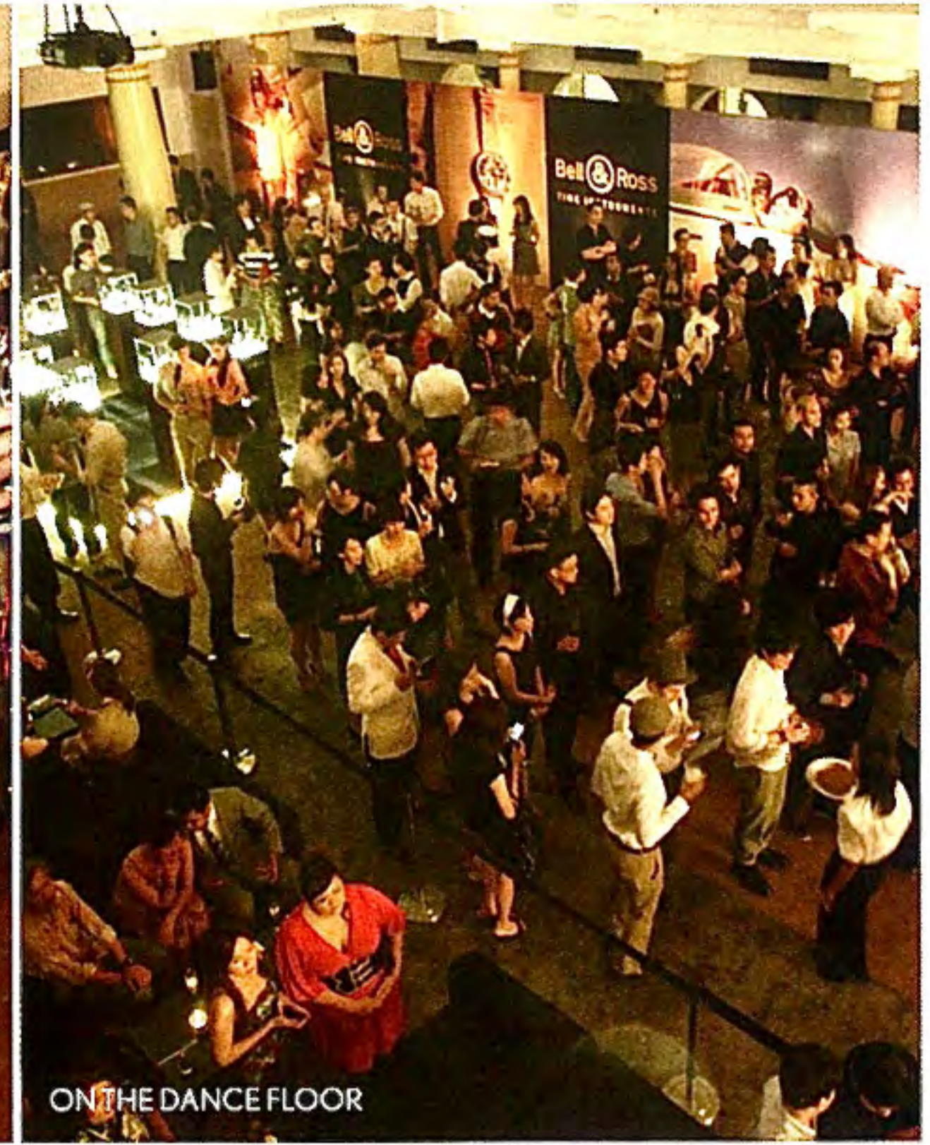
ON THE DANCE FLOOR